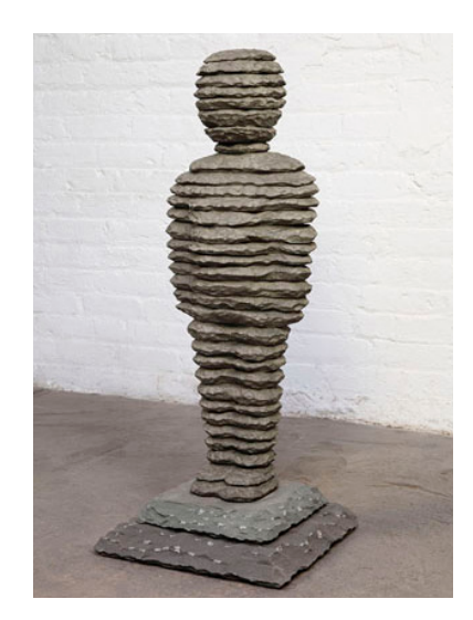
Milka, 2013. Bronze and bluestone.