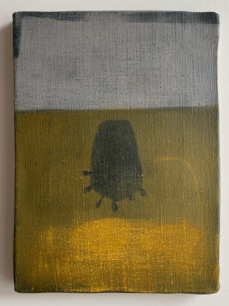
Left to right: Untitled #1958, 2019; Untitled #1969, 2019.