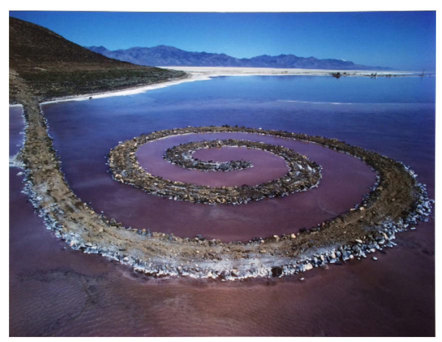
Spiral Jetty (3), 1970. Digital archival print.