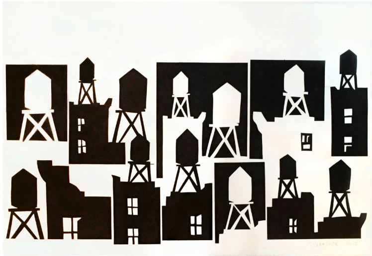
Watertowers Black , 2013. Flashe paint and cut paper collage. 30 x 44". Unique.