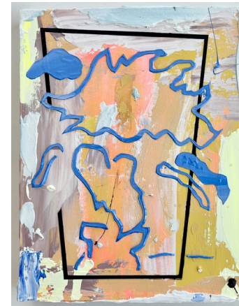
Sidekicks 17 , 2022 Acrylic on wood panel 12 x 9"