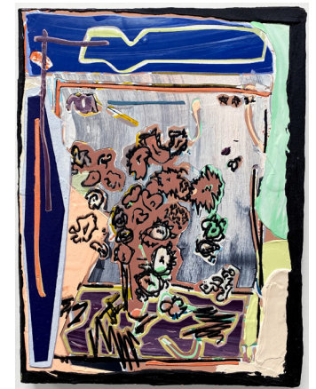
Sidekicks 9 , 2022 Acrylic on wood panel 12 x 9"