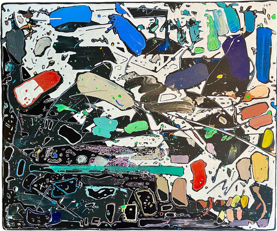
Deep End , 2021. Acrylic on wood panel. 30 x 36"