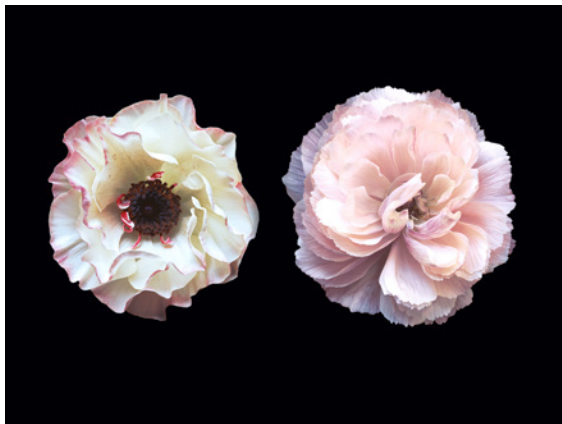
Open and Loaded , 2016.