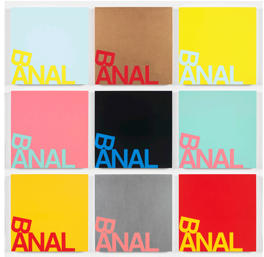
Grid of bANAL (2014) paintings, each acrylic on gessoed wood panel, 12 x 12".