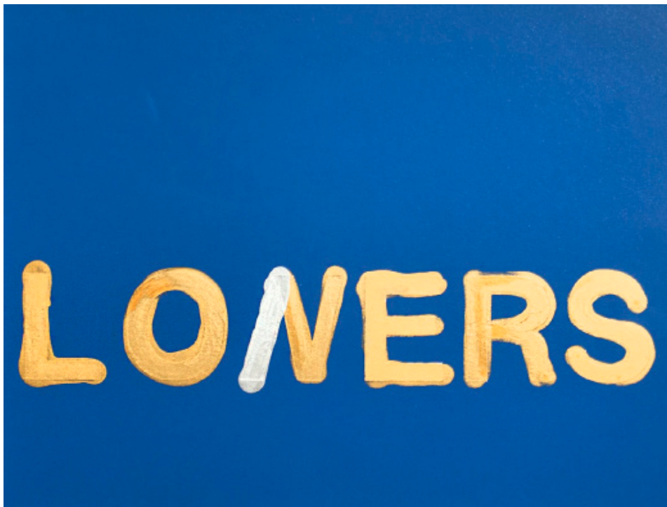
Loners/Lovers , 2015. Acrylic on paper. 26 1/4 x 22".