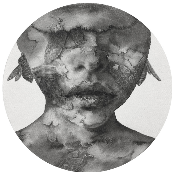
Reflection #11, 2017.