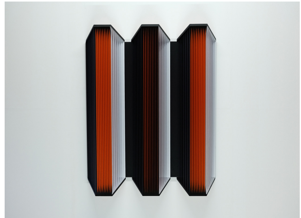
Stealth Orange , 2019. Cotton, nails, wood, emulsion paint. 39 3/4 x 31 1/2 x 6 1/4".

Collection Pforzheim, Pforzheim, Germany