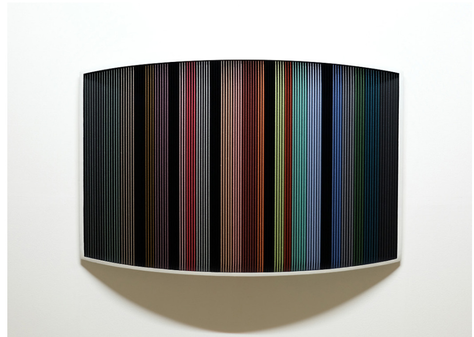
Pearl , 2019. Cotton, nails, wood, emulsion paint. 24 1/2 x 38 1/2 x 5".