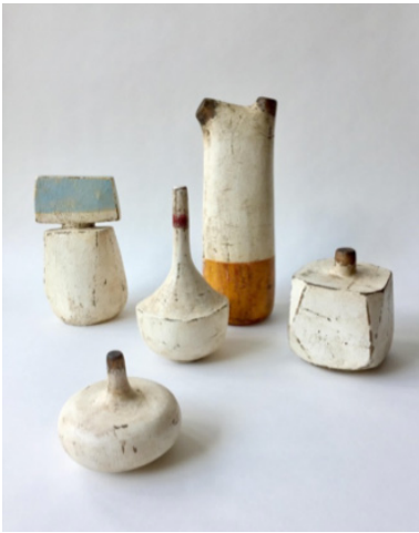
Untitled #474-#478, 2017.