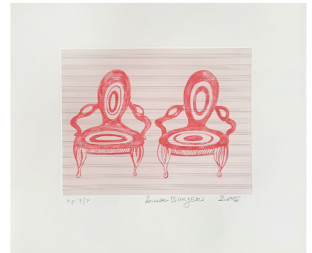
Louise Bourgeois. Twosome , 2005. Drypoint and softground with chine collé. 15 x 17". Edition 25.