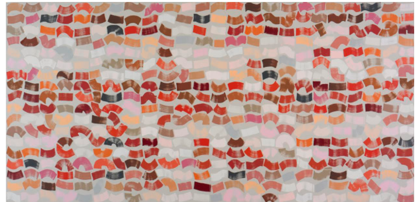
Jupiter Rising , 2012. Oil on canvas, 66 x 132"