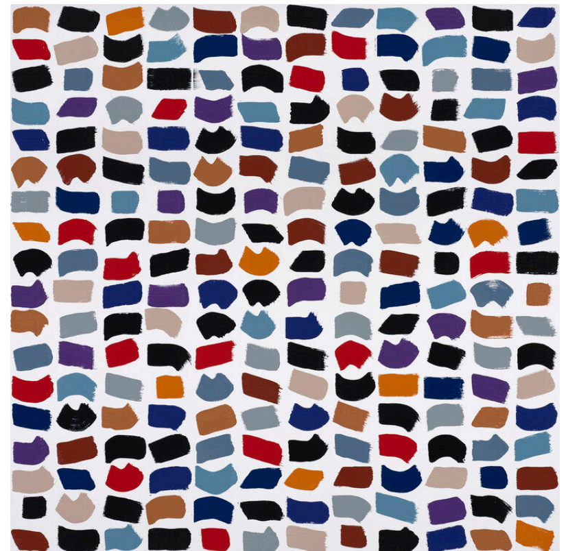
Queensbridge 5 , 2019. Oil on canvas, 66 x 66"