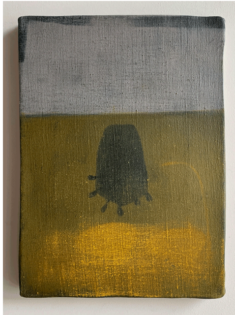
Left to right: Untitled #1958 , 2019; Untitled #1969 , 2019.