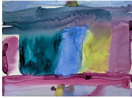
Third Floor 14, 2021. Watercolor. 11 x 15"