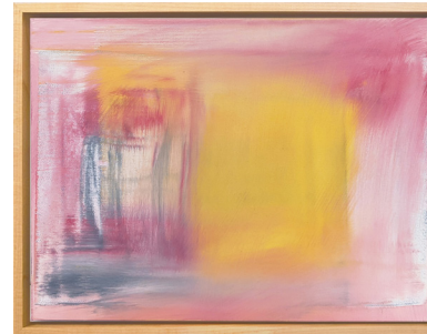
Modal 2, 2022. Oil on canvas. 12 x 16"