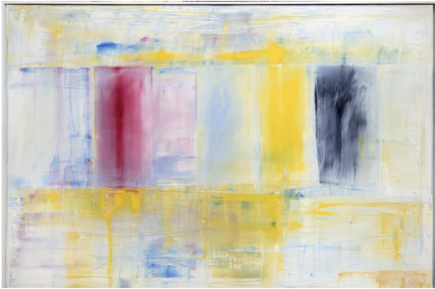
Liminal 11 , 2021. Oil on canvas. 48 x 72"