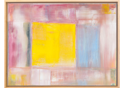
Modal 7, 2022. Oil on canvas. 18 x 24"