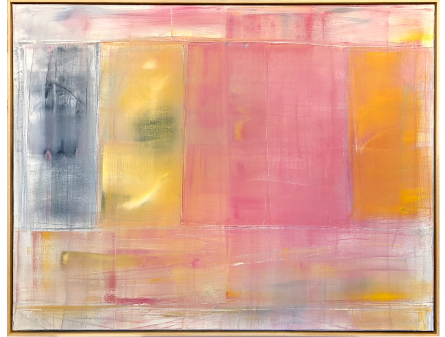
Modal 4, 2022. Oil on canvas. 48 x 60"

Private collections in North America and Europe.