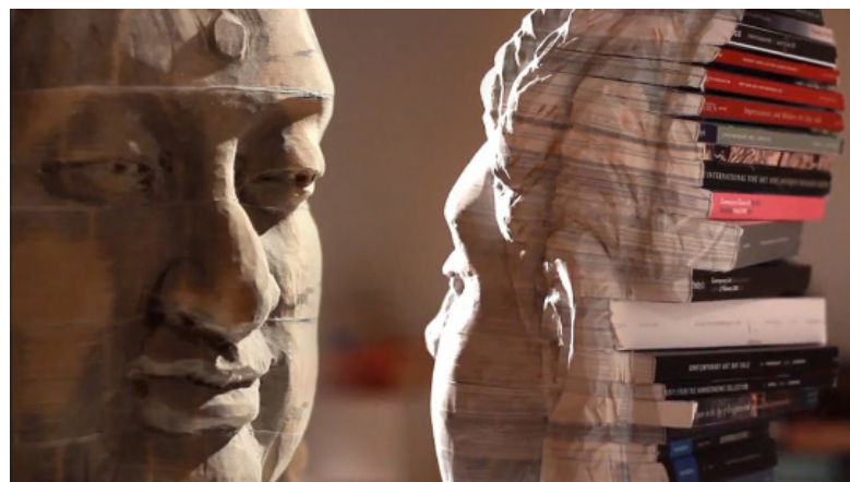
Ming Style Guan-yin , 2017. Auction catalogues. 16 x 11 1/2 x 9".

2016 Between the Covers: Altered Books in Contemporary Art , Everhart Museum, Scranton, PA 2015 Immortal Present , Berkshire Museum, Pittsfield, MA Unhinged: Book Art on the Cutting Edge , Whatcom Museum, Bellingham, WA 2014 Out of the Ordinary , Bascom: A Center for the Visual Arts, Highlands, NC Allan Chasanoff Book Art Collection , Yale Art Gallery, New Haven, CT 2013 Rebound: Dissections and Excavations in Book Art , Halsey Institute of Contemporary Art, Charleston, SC Freedom , MASS MoCA Kidspace, North Adams, MA 2012 The First Cut , Manchester Art Gallery, Manchester, England Do a Book , White Space Beijing Gallery, Beijing, China 2011 Buddha's Spur , Kunstmuseum, Bochum, Germany 2010 The Book: A Contemporary View , Delaware Center for Contemporary Arts & Towson University, Towson, MD Special Choice Book Arts Part II , Williamsburg Art and Historical Center, Brooklyn, NY State of the Dao , Chinese Contemporary Art, Lehman College Art Gallery, Bronx, NY